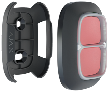
Holder for Button/DoubleButton is sold separately